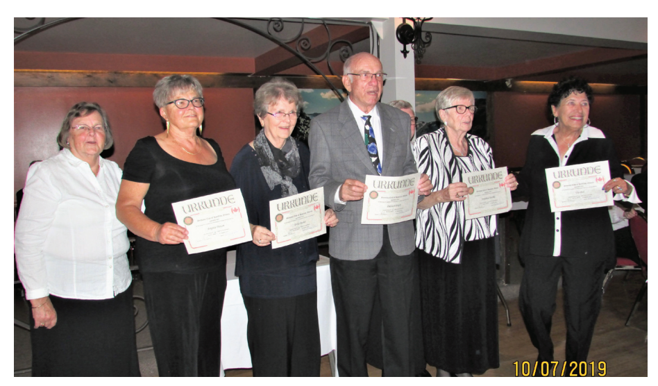
40 Year members who joined in 1979, the first year that women were allowed to be voting members of the Club.